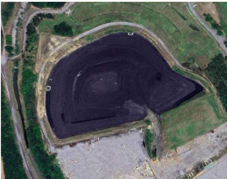
Figure 1: Aerial Photograph - 2023

Since the past annual inspection, there were no observed changes in the geometry of the landfill.