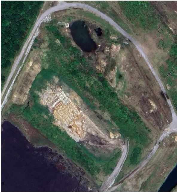
Figure 1: Aerial Photograph - 2023