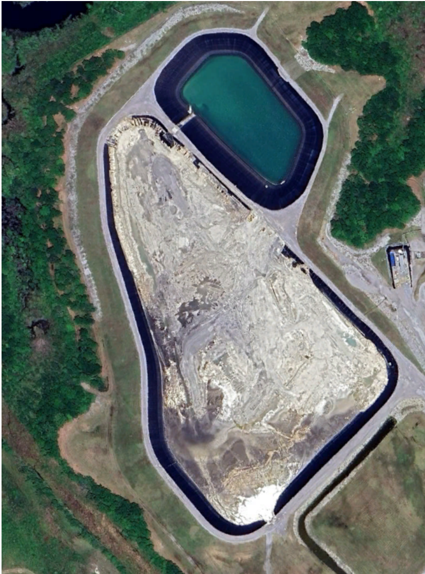
Figure 1: GCEC Gypsum Storage Area Aerial - 2023